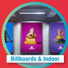
Billboards & indoor